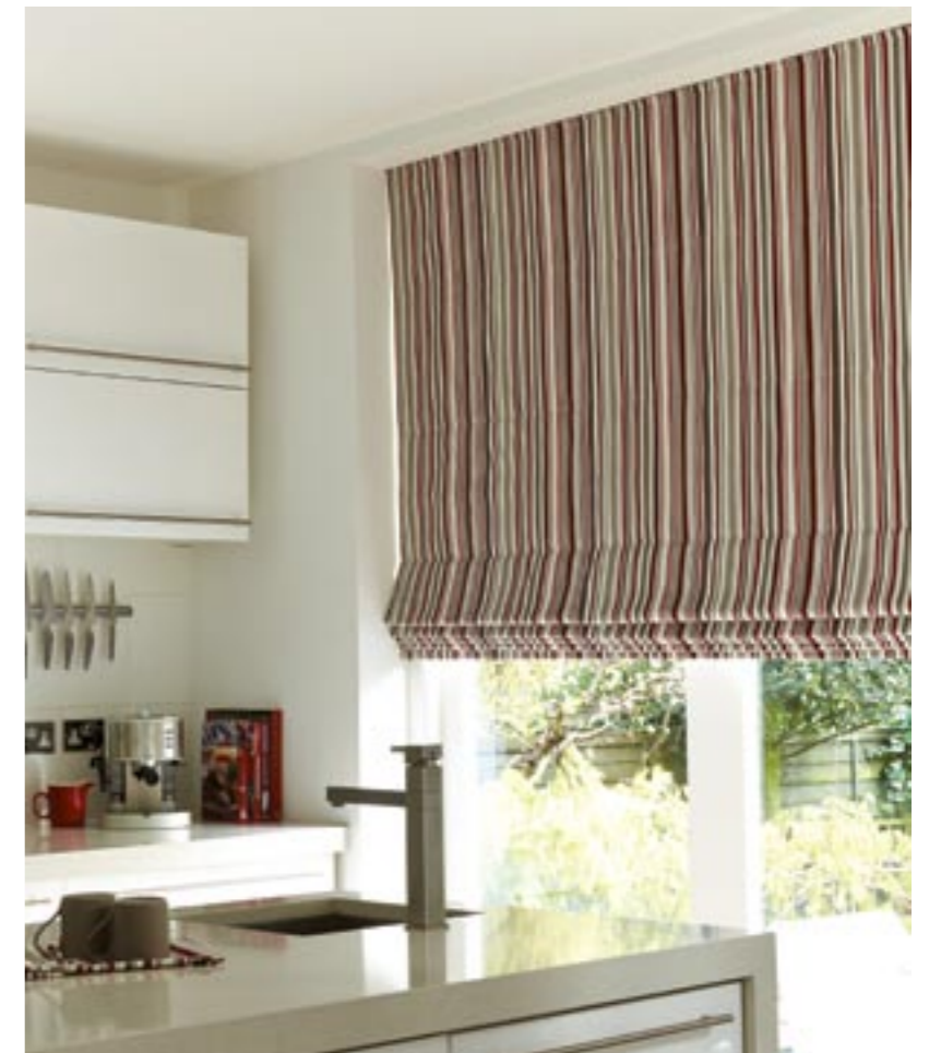
Sea Stripe Cherry Roman Blind

When dressing large windows the scale of pattern is critical. Too large a print can overpower, too small looks fussy and will blend into the background.