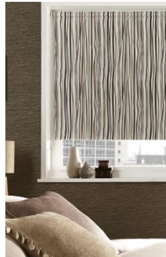
Frazier Charcoal Roller Blind