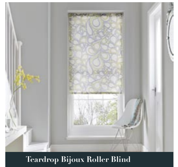
Teardrop Bijoux Roller Blind

Consider a Roller, Pleated or Metal Venetian in a PerfectFit frame for a window dressing that's contemporary, sleek, child safe and requires no drilling to fit.