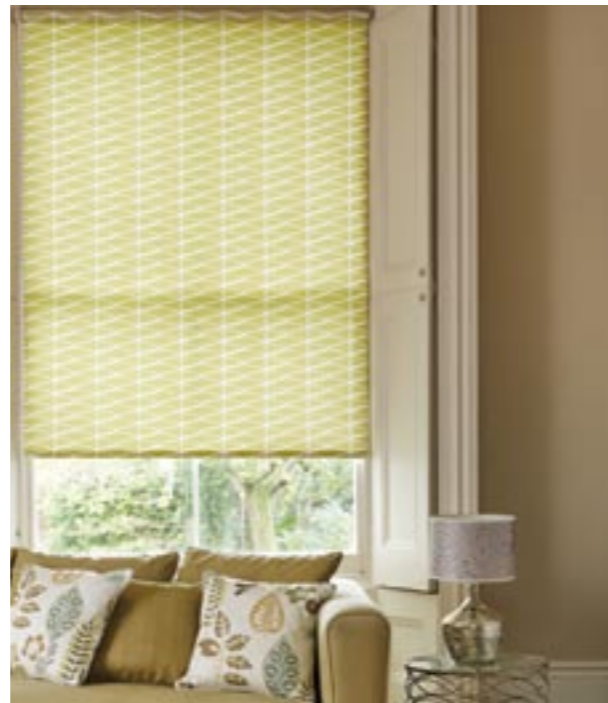
Illusions Green Roller Blind

Not sure what treatment you should use at your window? Here's some advice to help you decide which window dressing is right for you!