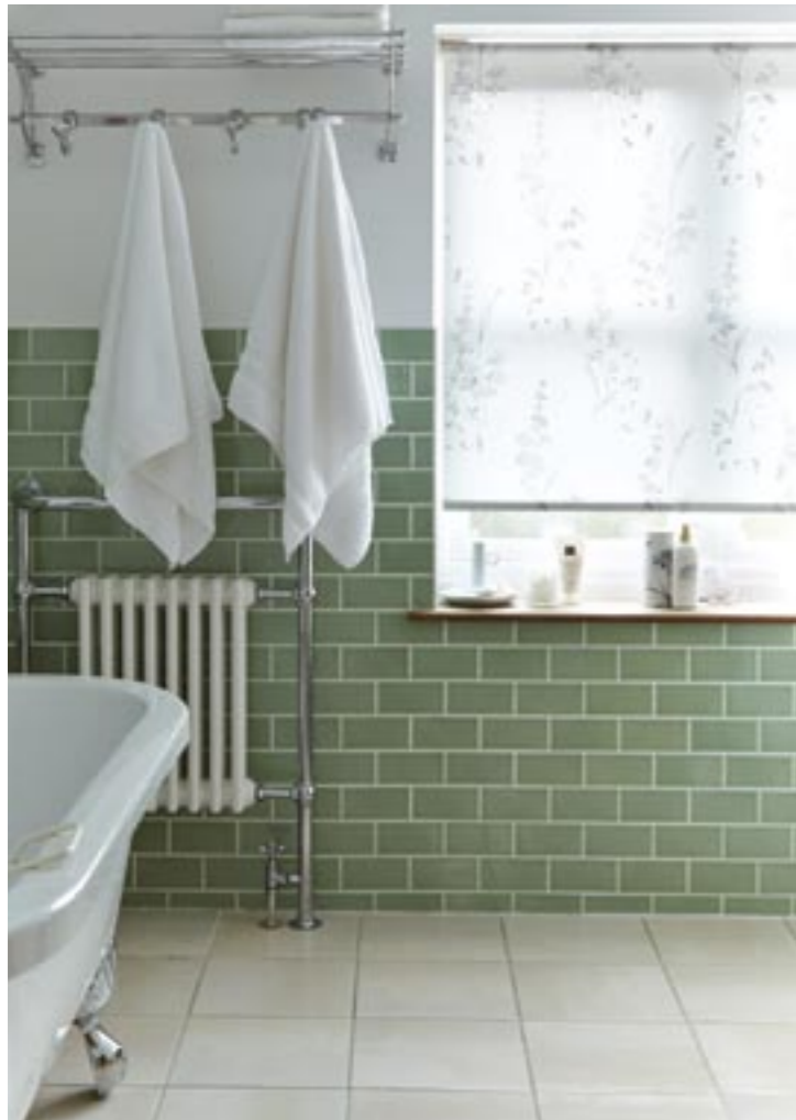
Cameline White Roller Blinds