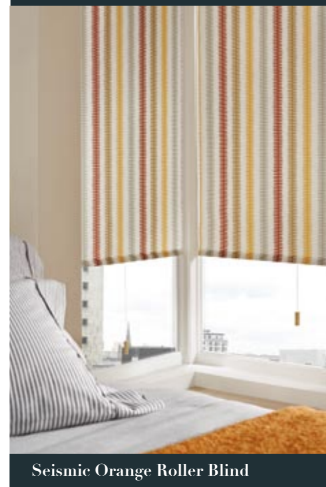
Seismic Orange Roller Blind