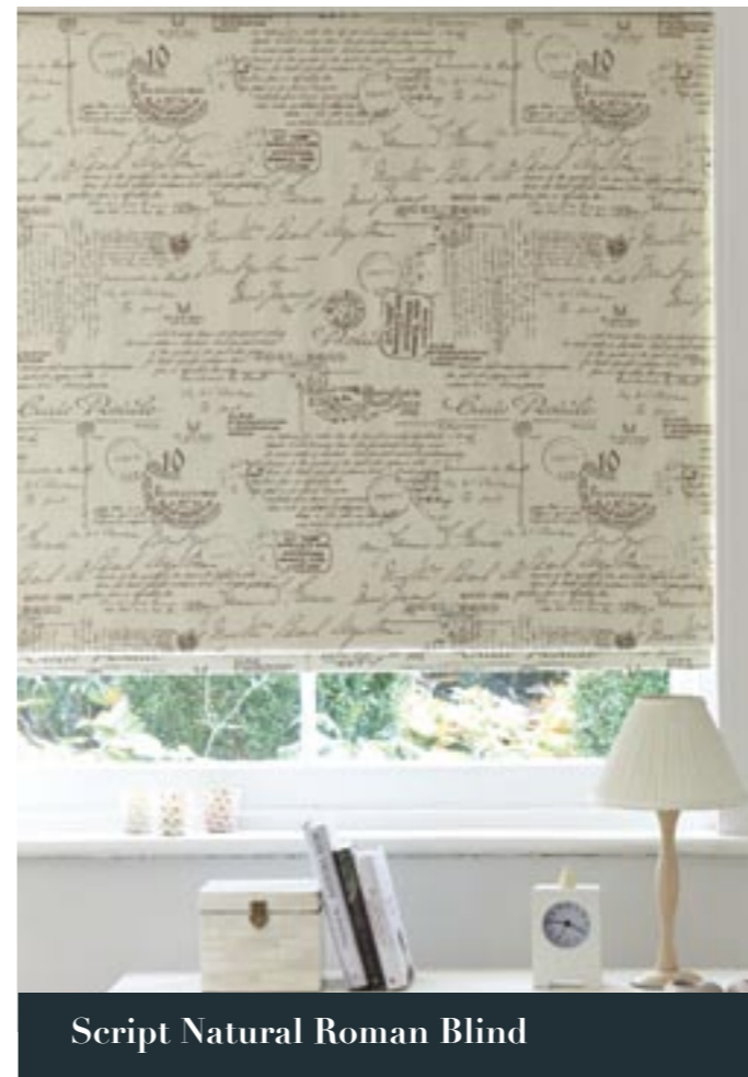
Script Natural Roman Blind