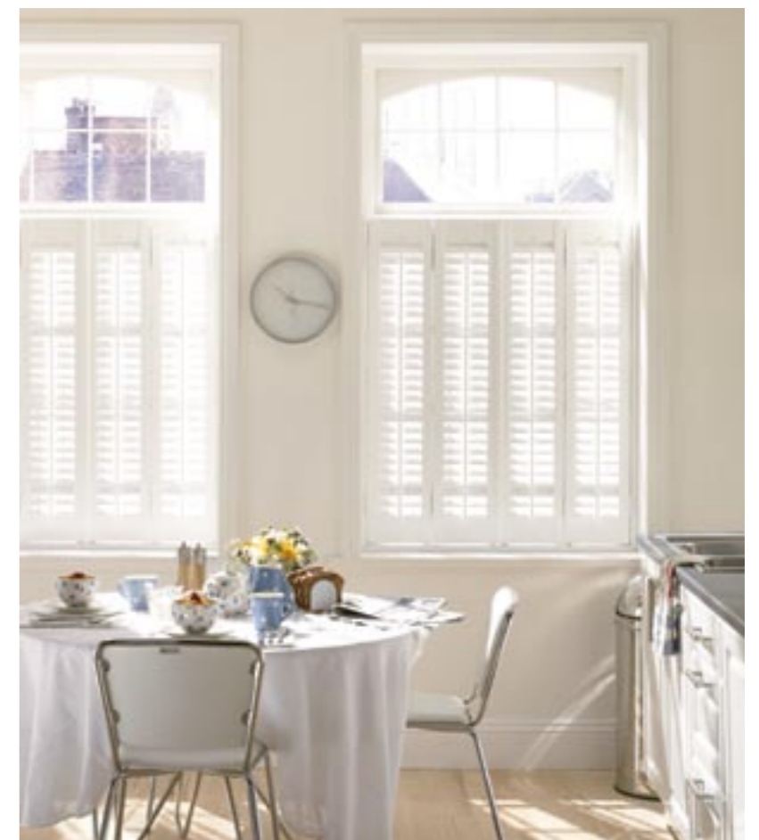
Classic Silk White Shutters

Give a lovely continental feel to your kitchen with cafe style shutters. It'll be a little cheaper than full shutters and they'll let in even more light.