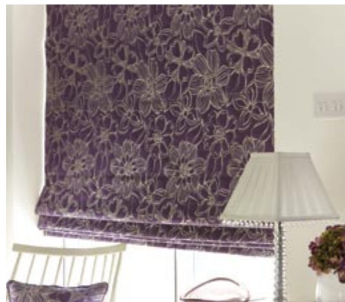
Constantine Purple Roman Blind

The trend for lush berry shades is here to stay: Mingle purple and lavender with rich plum for a lovely luxe look.