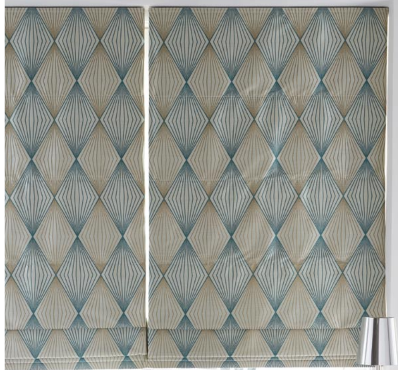
Aruba Teal Roman Blinds

The living spaces in your home are where you spend most of your time and you want to create your own sense of style, as well as a place that works for your lifestyle and for your family. Window dressings complete a home. They add colour, texture, softness and personality. Whether you're putting the finishing touches to a newly decorated room, or simply reviving an existing one, a new window dressing can make all the difference to tie a scheme together.