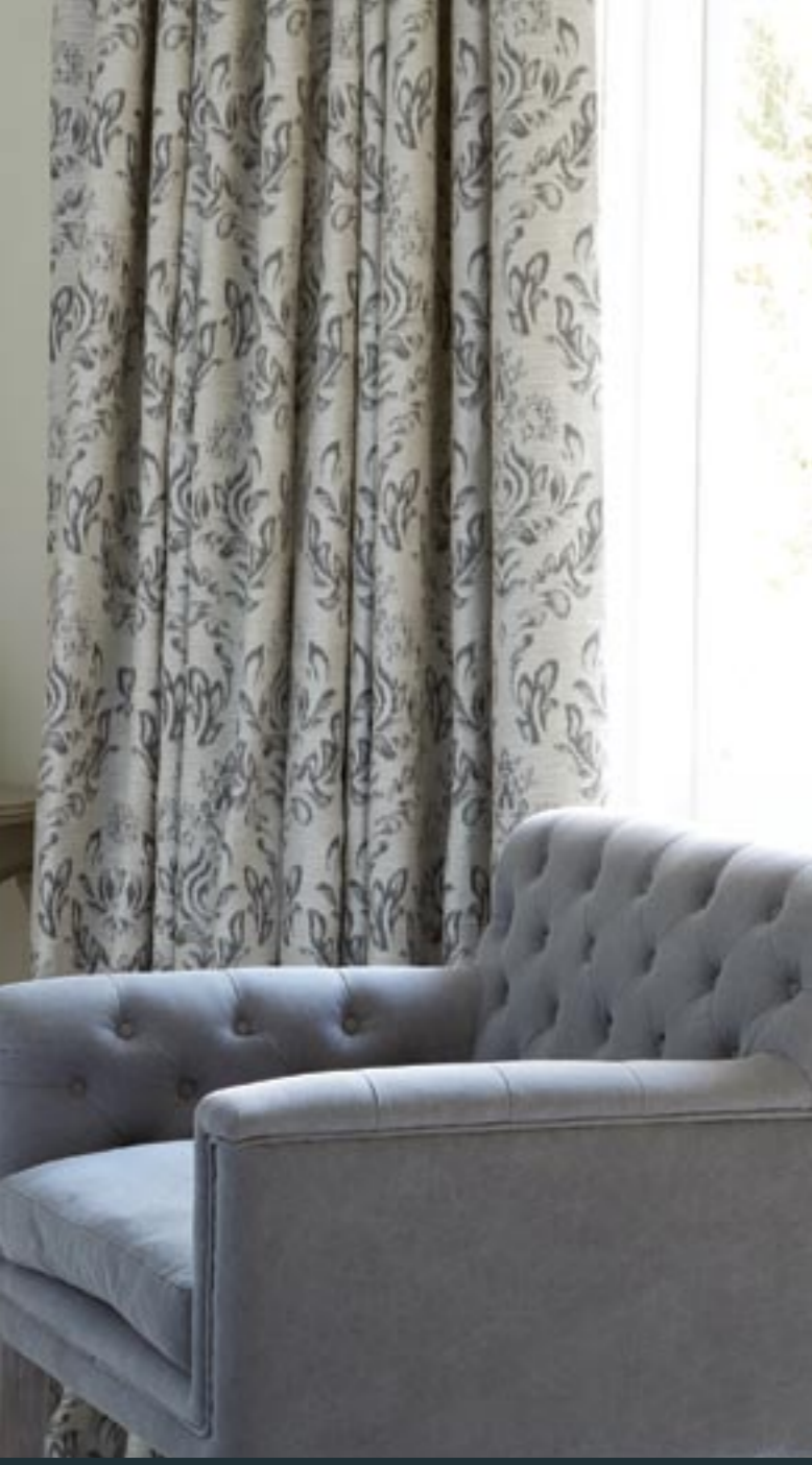
Anatolia Grey Curtains