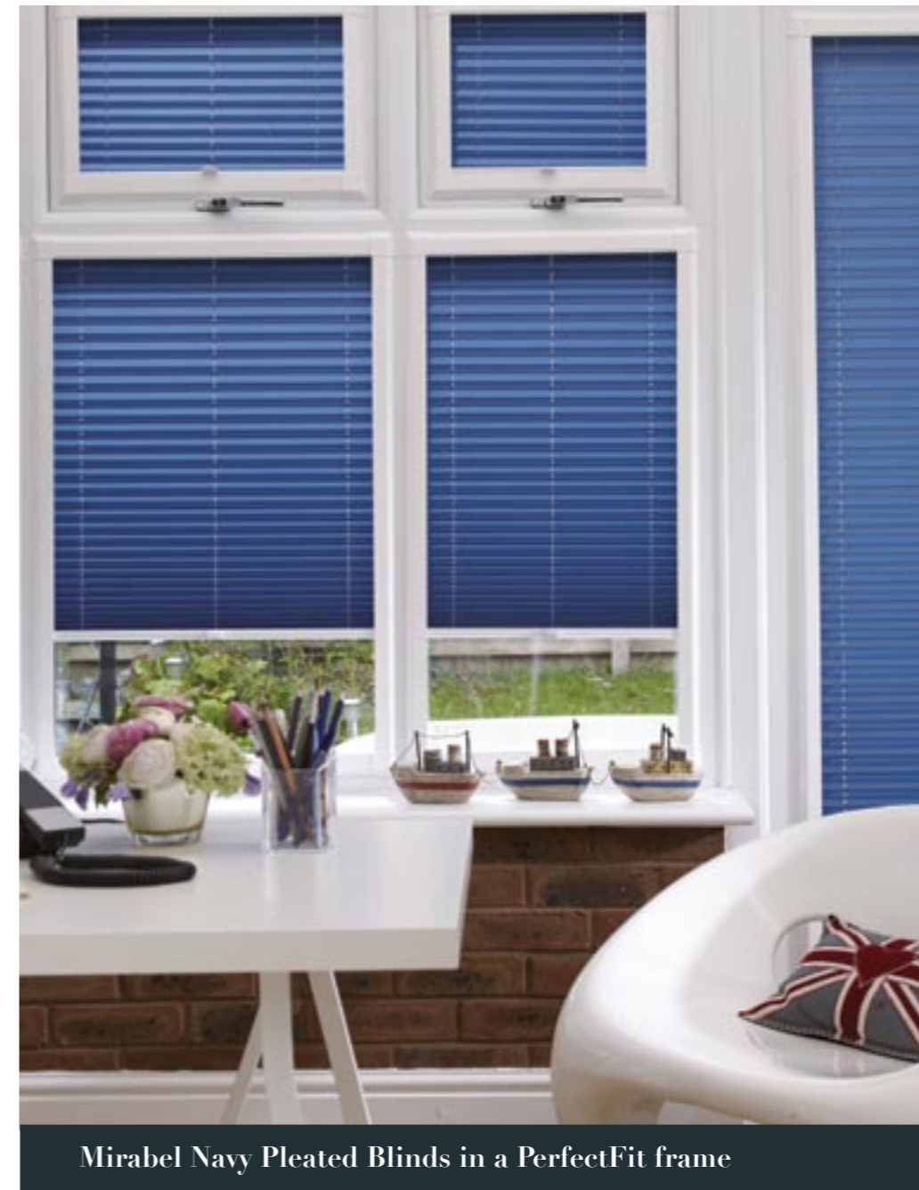
Mirabel Navy Pleated Blinds in a PerfectFit frame