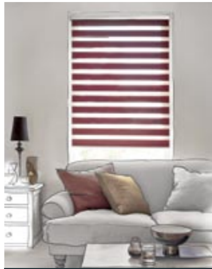
Nova Ruby DuoLite Blind