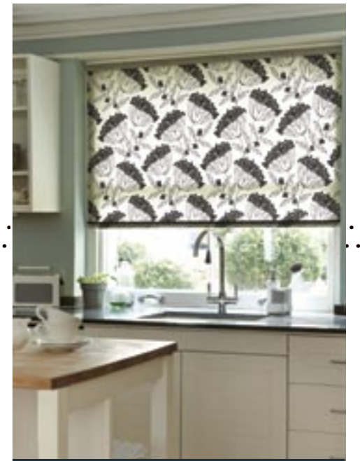
Willersley Graphite Roller Blind

Television, computer, cooking or children playing? All will have an impact on how much light you want to come into the room or whether you need a window treatment that works well in certain conditions.