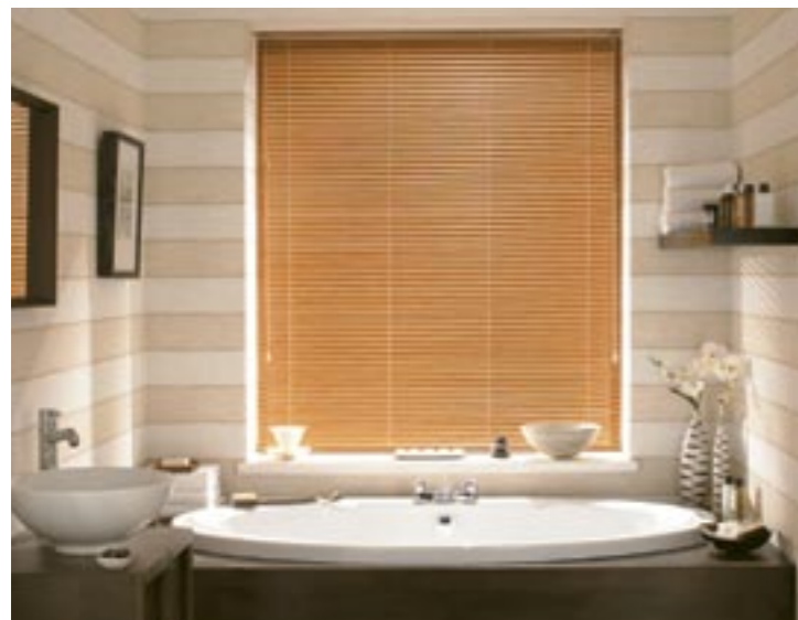
Scottish Pine Aluwood Venetians

If this is your number one priority then consider Venetians as these will allow plenty of light in, but keep prying eyes out. The trend for sheer fabrics will also have the same effect during the daytime.