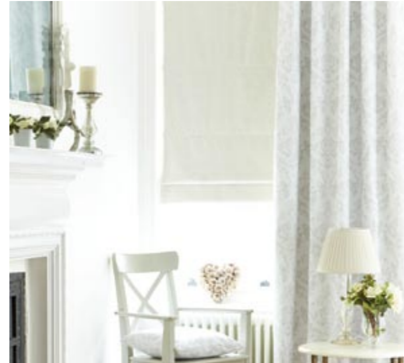
Hastings White Roman Blind, Anatolia White Curtains

When you have lovely feature windows, it's often better to accentuate rather than dominate. Simple Roller blinds or neat Pleated blinds fit inside the frame to maximise the space and with clever use of translucent fabrics, the design of the window itself is clearly visible whilst maintaining privacy inside the room.