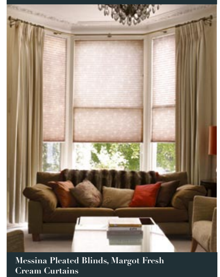
Messina Pleated Blinds, Margot Fresh Cream Curtains