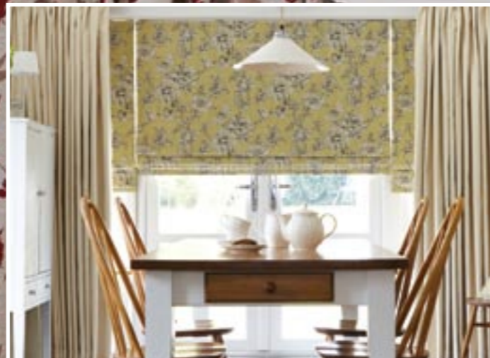
Botanical Garden Sage Roman Blinds

Choose a Roman in a plain fabric if using patterned curtains, or vice versa, for a stylish and co-ordinated look. Take inspiration from country houses and pile on the pattern. Botanicals work particularly well.