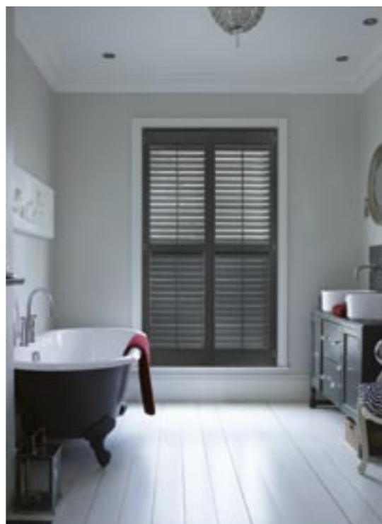
Groveswood Wall Grey Shutters