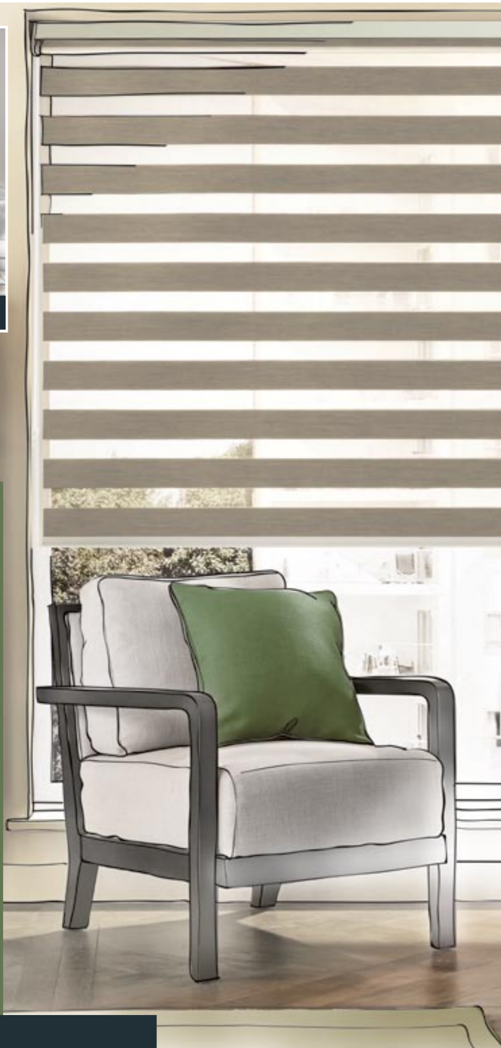
Detra Straw DuoLite Blind

DuoLite™ Rollers are made using two layers of special fabric combining both opaque and sheer stripes. The fabric layers move independently of one another, so you can choose to filter the light or close the blind for full privacy. This unique Roller blind is available in a choice of 12 colours from cool, sophisticated neutrals to vibrant reds.