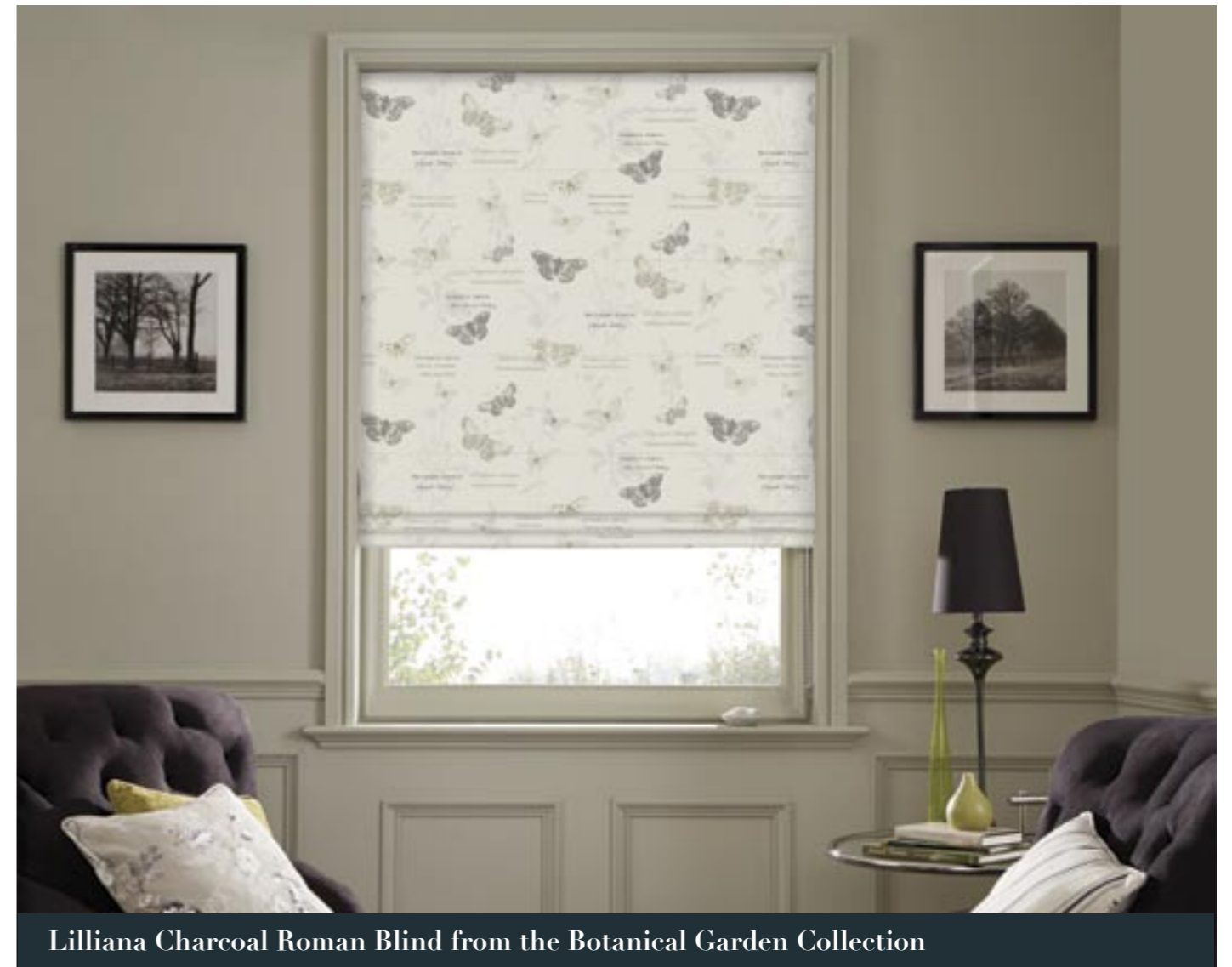
Lilliana Charcoal Roman Blind from the Botanical Garden Collection

Have a flutter with the trend for butterflies.