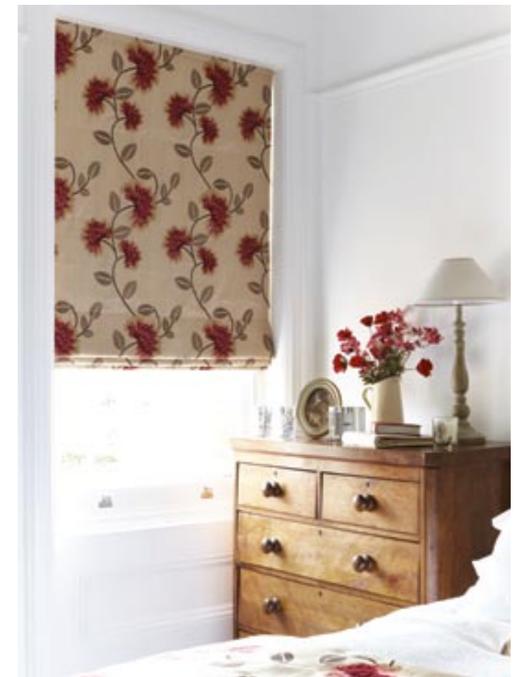
Mikado Flame Roman Blind