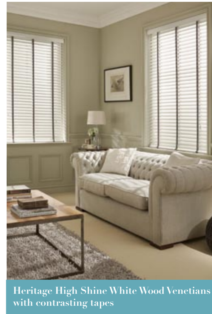
Heritage High Shine White Wood Venetians with contrasting tapes