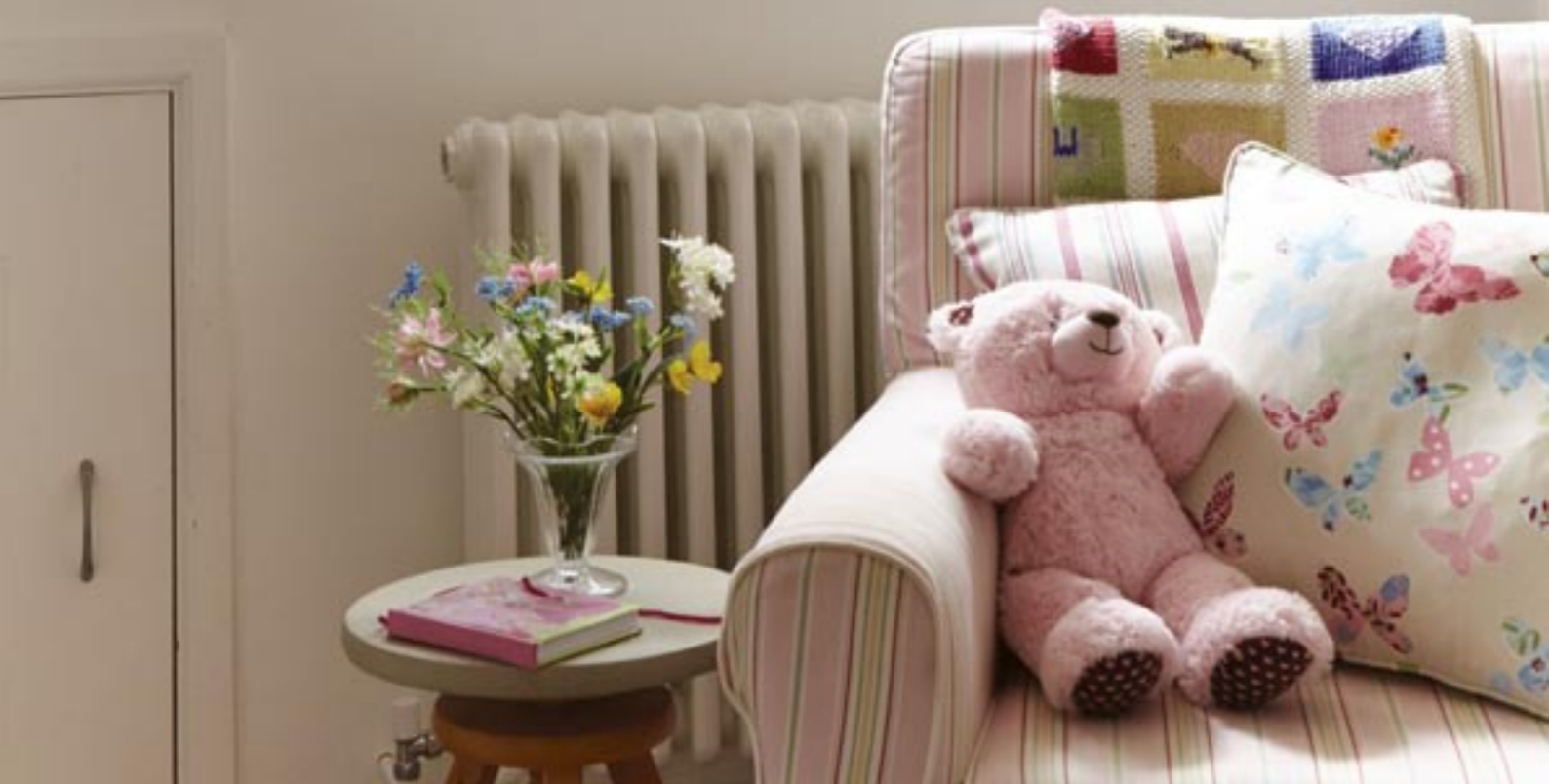
Flutter-By Vintage Roman Blind

All our Romans are fully lined as standard to help protect against the sun and keep the heat in.