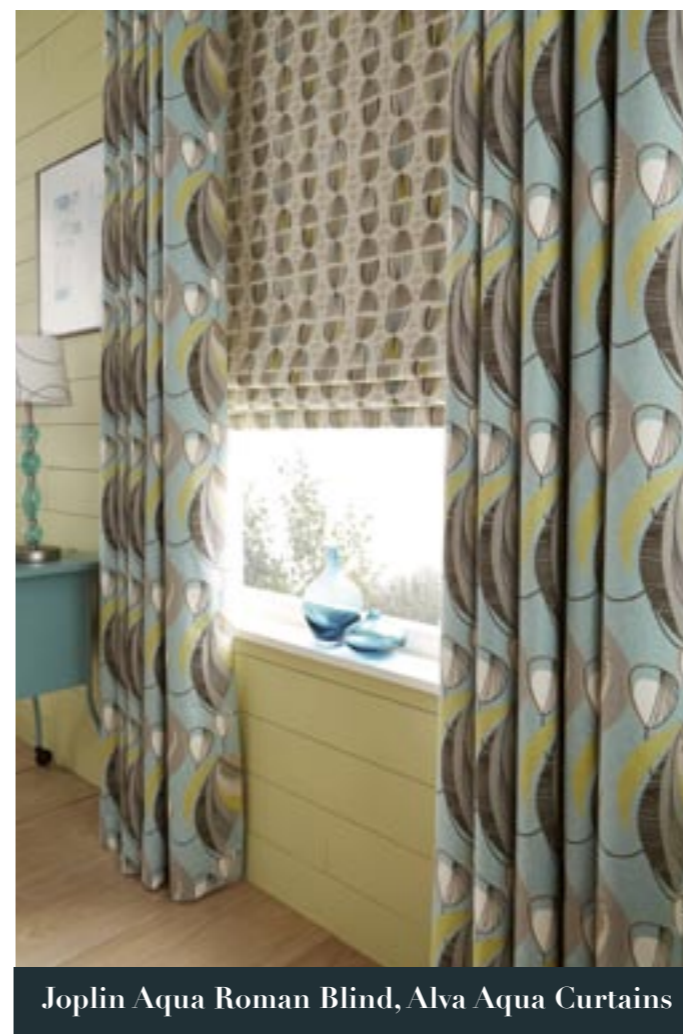
Joplin Aqua Roman Blind, Alva Aqua Curtains

Light, bright airy spaces create a sense of calm and well-being. Wood Venetians are a lovely modern choice for windows, especially those that face out onto a busy street as the slats can be adjusted for privacy but still let in plenty of light.