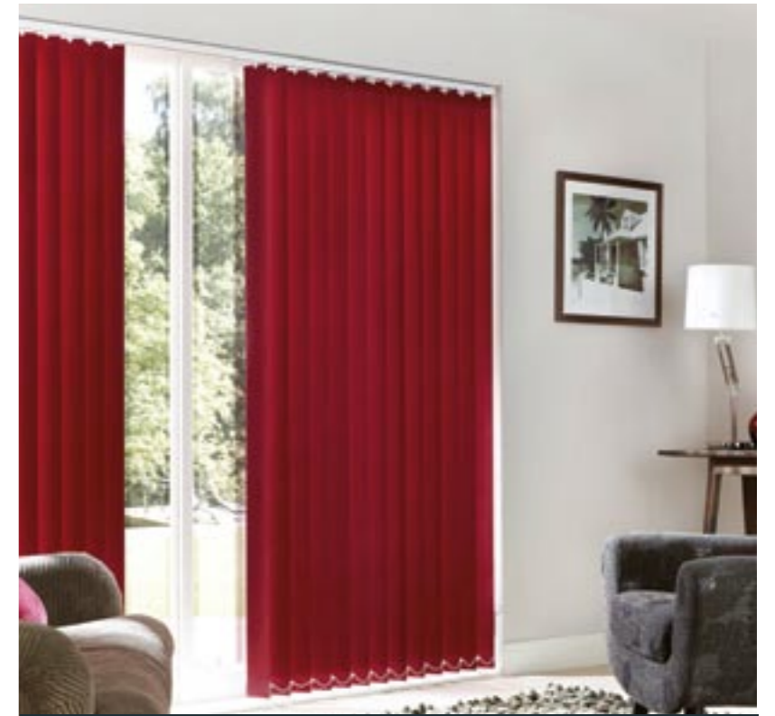
Memphis Raspberry Vertical Blinds

Verticals are a great option for patio or bi-fold doors.